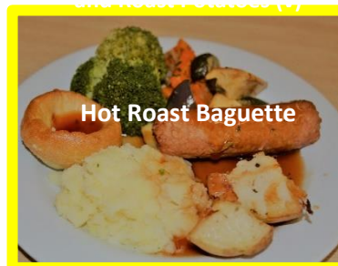
Hot Roast Baguette