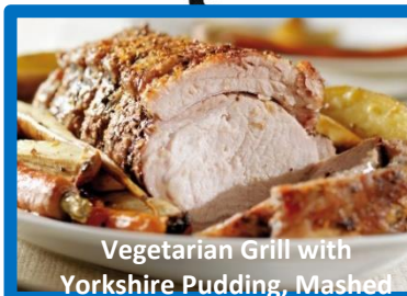
Vegetarian Grill with Yorkshire Pudding, Mashed