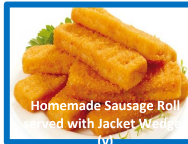
Homemade Sausage Roll served with Jacket Wedge