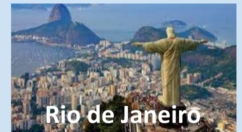
Rio de Janeiro